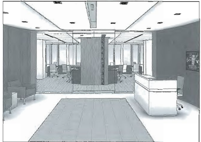
Rydex SGI Entry by Hickok Cole

FORMA is proud to announce the completion of our latest healthcare project, Bloo Dental, a state-of-the-art family dental practice in Brambleton, VA. Keep an eye out for some exciting new projects in our Spring Newsletter. Bitar Cosmetic Surgery Institute and Capital Oral and Facial Surgery Center are our latest medical spaces under-construction.